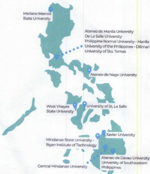
Data as of April 18, 2022